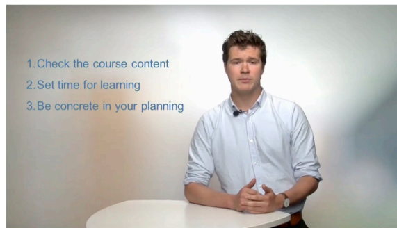
Fig. 2. Screenshot of the study suggestions given in the intervention video.