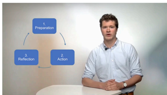
Fig. 1. Screenshot of the SRL model presentation in the intervention video.

The scripts of the intervention videos and the questions presented to learners are available as online supplementary material.